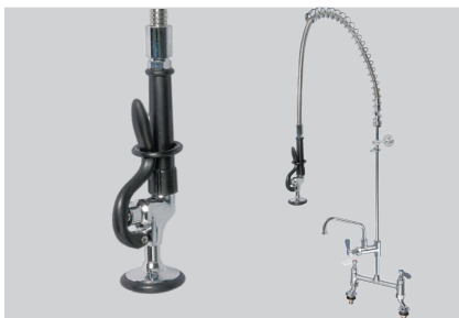
Pre-Rinse Spray Arms